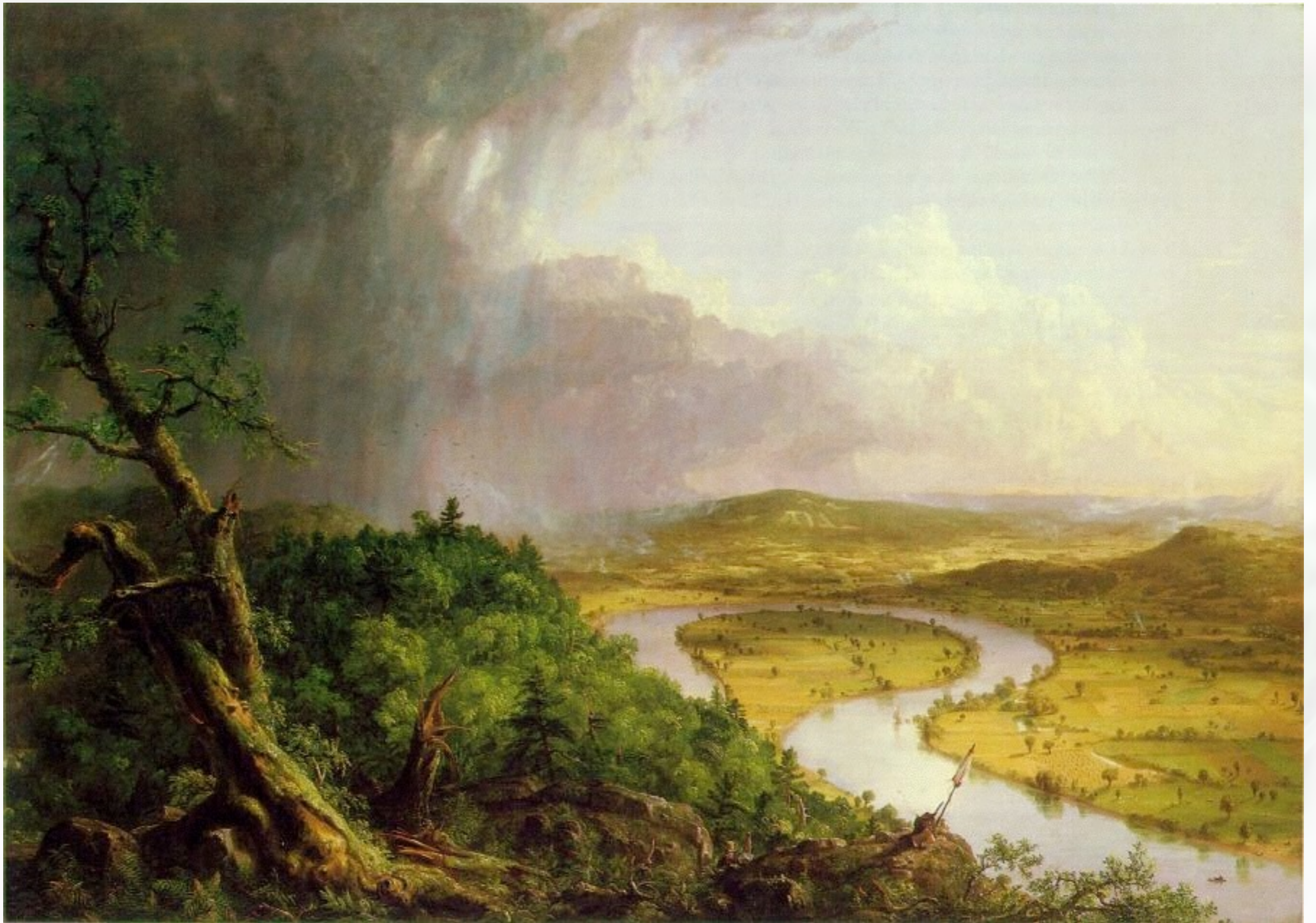
Thomas Cole, The Oxbow (1836)