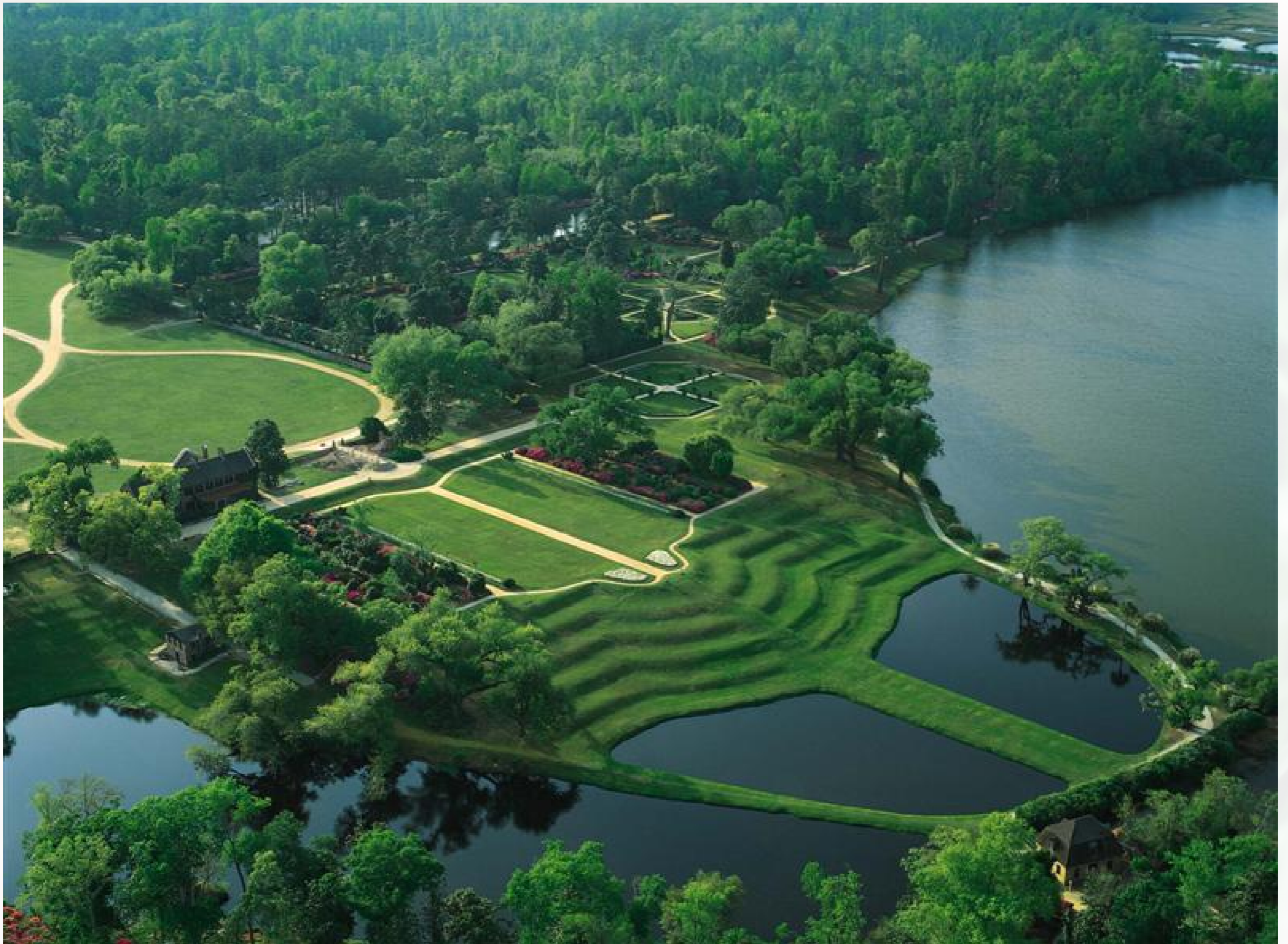
Butterfly Lakes, Middleton Place